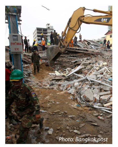
A building collapsed in Sihanoukville

However, the practicality of the 2019 Construction Law is somewhat questionable due to the growing development of construction in Cambodia. Are there enough resources available to cope with the significant volume of new buildings while at the same time catching up the backlog of literally every single building in the country? The implementing of this new Law will probably be challenging, perhaps done gradually by the authorities.