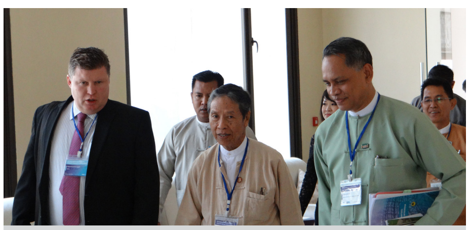
Government Guarantees for PPP Projects in Myanmar March 31, 2017, Nay Pyi Taw.

Rule 126 states that a land use application may be approved pending and subject to additional procedures being completed, such as a change of use approval. This may lead to the unenviable situation where the investor has obtained an MIC approval for the land, but fails to obtain the change of use approval from another authority. Rule 133 confirms the existing practice that if the land is under a land grant application procedure, evidence of the same shall be submitted, and is usually accepted.